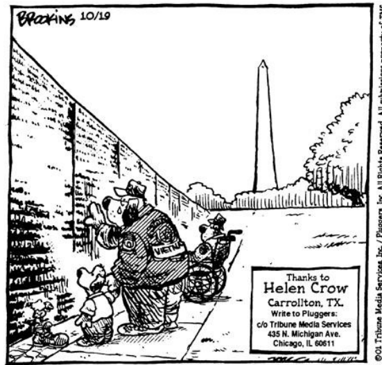
A plugger keeps his promise to look up his friends after the war.