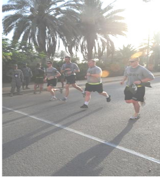
Iraq Run Race Start